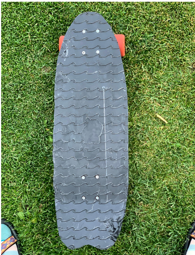
Large Skateboard Prototype