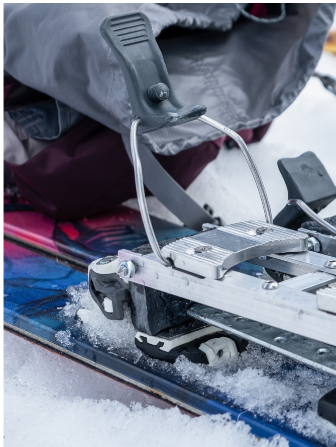
Backcountry Ski Adapter Prototype